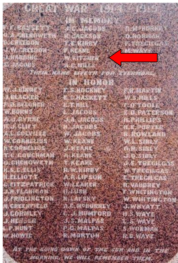
Willunga War Memorial